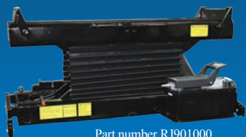
Part number RJ901000

Alignment lifts come standard with two 9,000 lbs. capacity rolling jacks