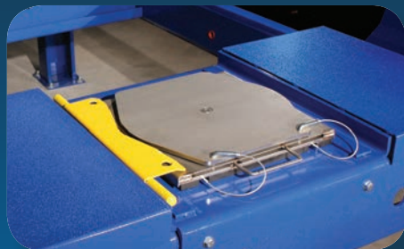
Photo shows optional stainless steel turning radius gauges

Alignment lifts come standard with two carbon steel turning radius gauges - roll back bar allows the gauges to be placed in the front or back of the slot while keeping a flat runway surface.